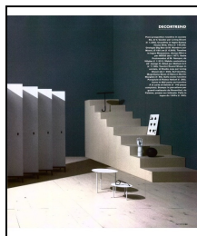
Elle Decor (I)