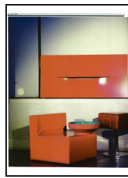
Interni Annual (I)