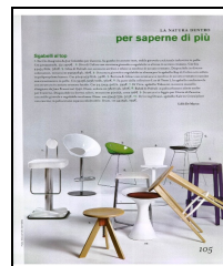
Marie Claire Maison (I)